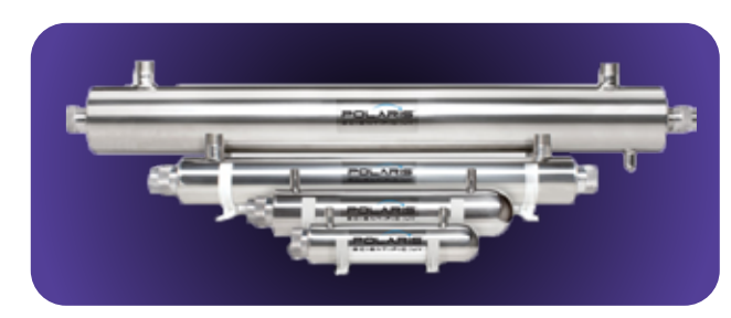
Polaris Ultraviolet Systems

Aquatek UVA-418-S22 water disinfection system offers an economical and chemical-free way to ensure potability and safeguard your drinking water in most residential and light commercial applications. Perfect for applications up to 18 gpm and with the 3 stages of treatment addresses taste and quality, odor, turbidity, chlorine reduction and utilizing the power of Polaris UV technology to sterilize and protect against harmful bacteria and viruses.